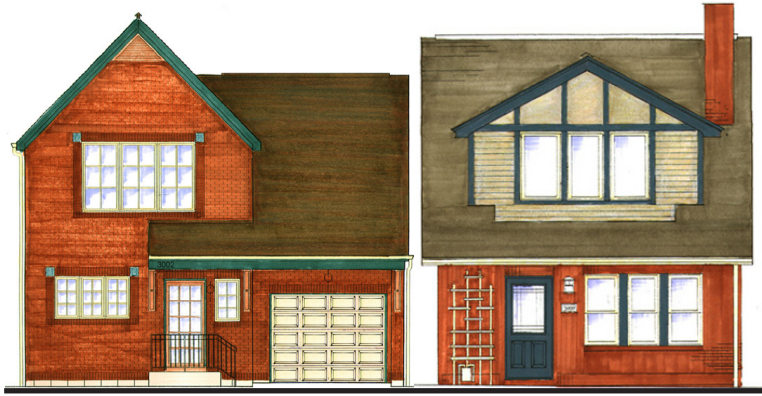
New Unit Sample