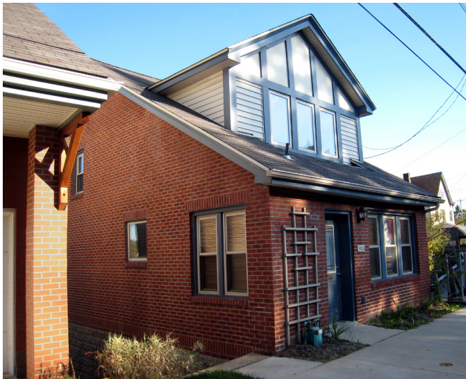
Completed Rehab Unit