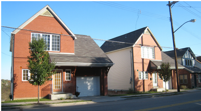
Hillside New Units