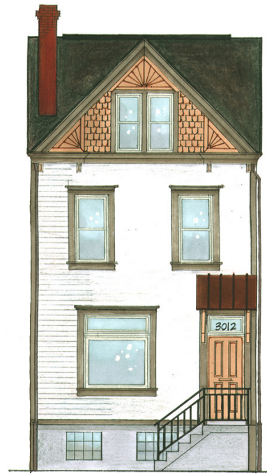
Rehab Unit Sample