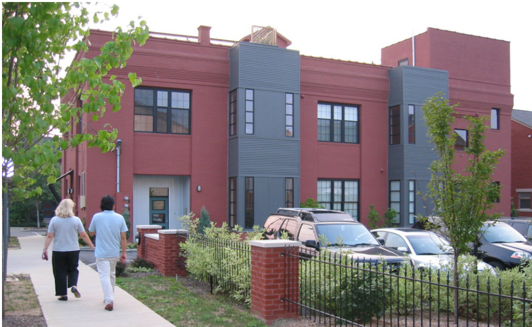
View after renovation