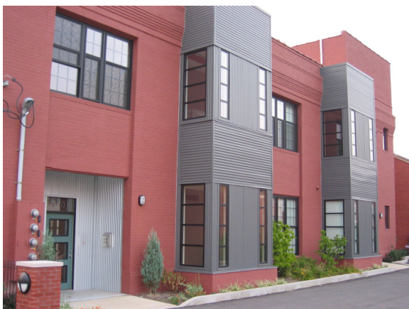
View towards unit entrance