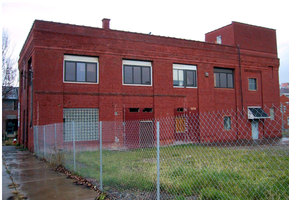
View prior to renovation