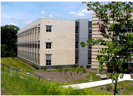
South Central Regional Office Building Harrisburg, PA