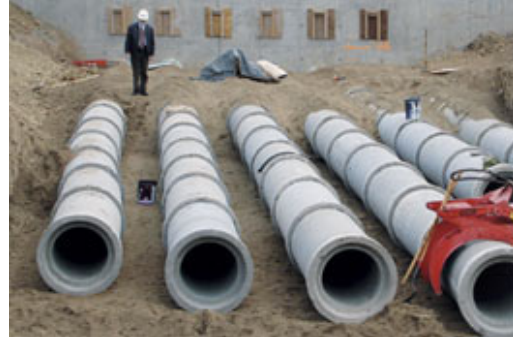
Earth tubes buried under frost line pre-condition the supply air