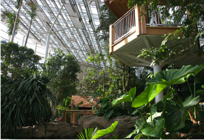
New addition for special exhibitions

Recommendations to improve the performance a $45 million upgrade to this 100 year old Pittsburgh landmark. Collaborating with Professor Fisch, of EGS Plan, Germany, ventilating earth tubes have been incorporated into the construction of the tropical rainforest conservatory and a rainwater harvesting system is being investigated for the production greenhouses .