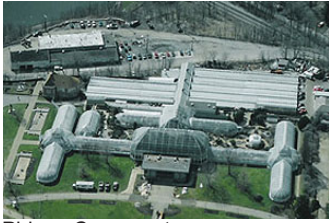
Phipps Conservatory Pittsburgh, PA