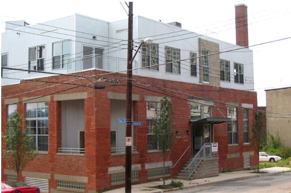
view from Colwell street