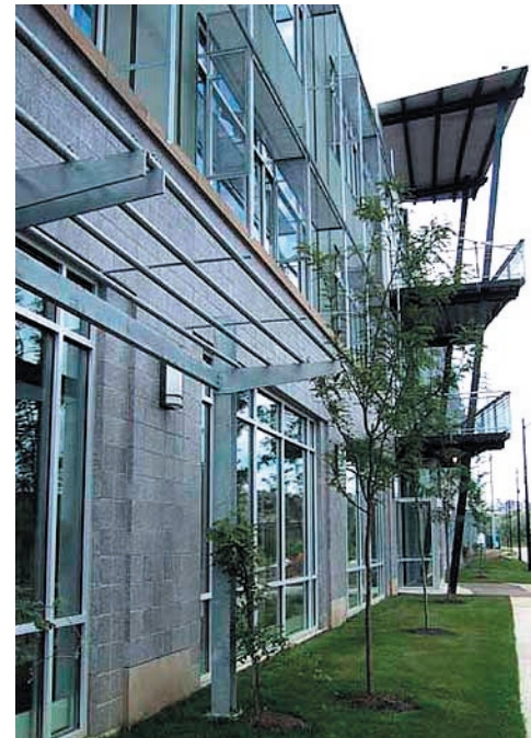
arbor and sunshading device