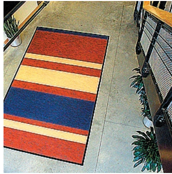
atrium floor with linoleum collage