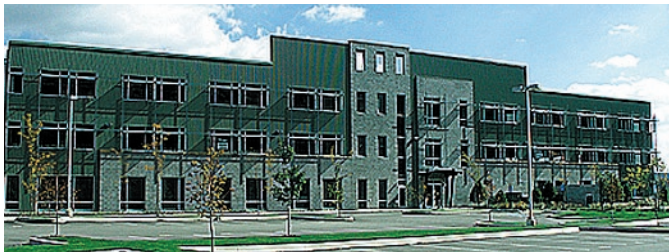
parking lot side