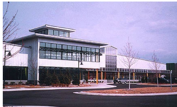
outdoor rink wing