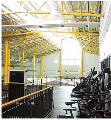
fitness area with daylighting