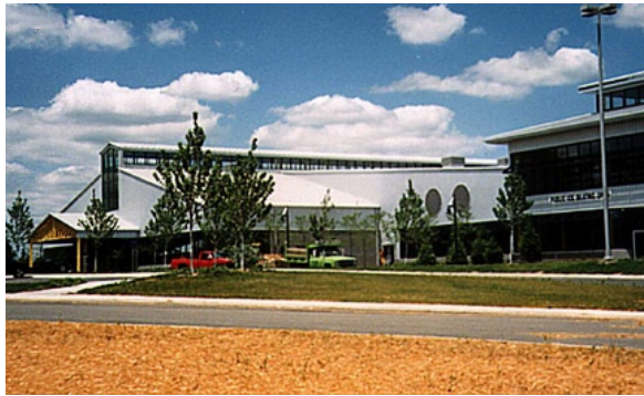
indoor rink wing