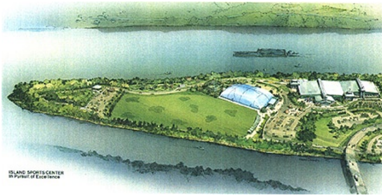
ISLAND SPORTS CENTER In Pursuit of Excellence