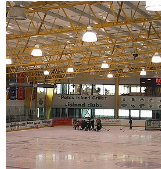
ice rink interior: specially treated water and specialized high efficient HVAC system allow to create and maintain superior ice surface.