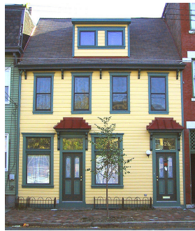
New Structure Behind Rehabbed Facade