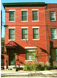
New on Existing Foundation